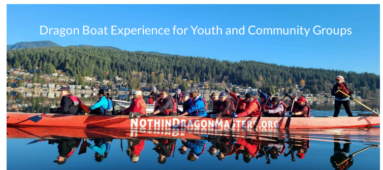
Dragon Boat Experience for Youth and Community Groups